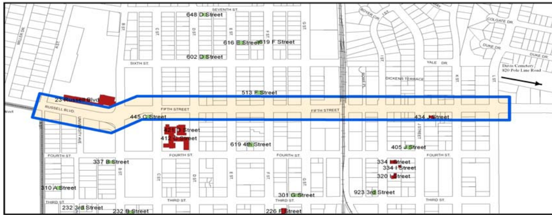
City of Davis Designated Historical Resources Fifth Street Corridor

a) No Impact. There are a number of historic sites, some publicly owned, and a public park immediately adjacent to the project area. The following map shows the locations of the historic resources adjacent to the roadway (listed in the Davis Register of Historic Places).