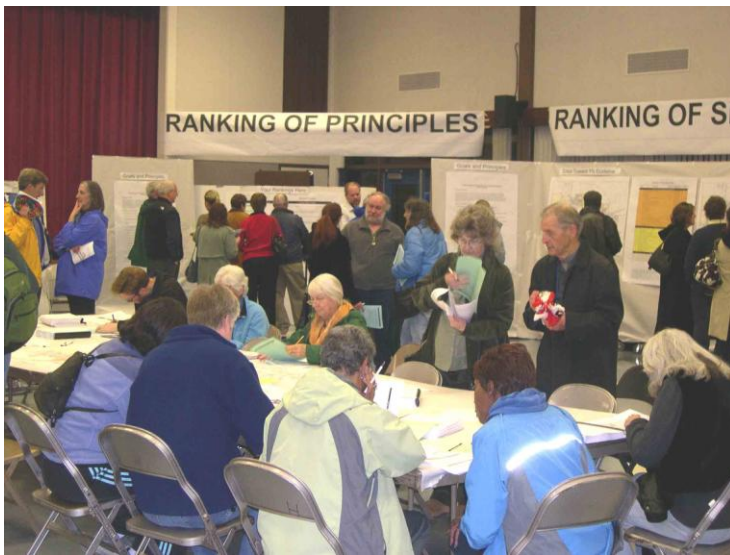
Work Table and Stations

Station #5 — Directions for Housing. A COMMENT SHEET was provided for Station #5 to obtain comments concerning overall directions, trade-offs and strategies the community should pursue in meeting its housing needs and in identifying potential sites for housing. Space on the comment sheet was also provided for “other comments.”