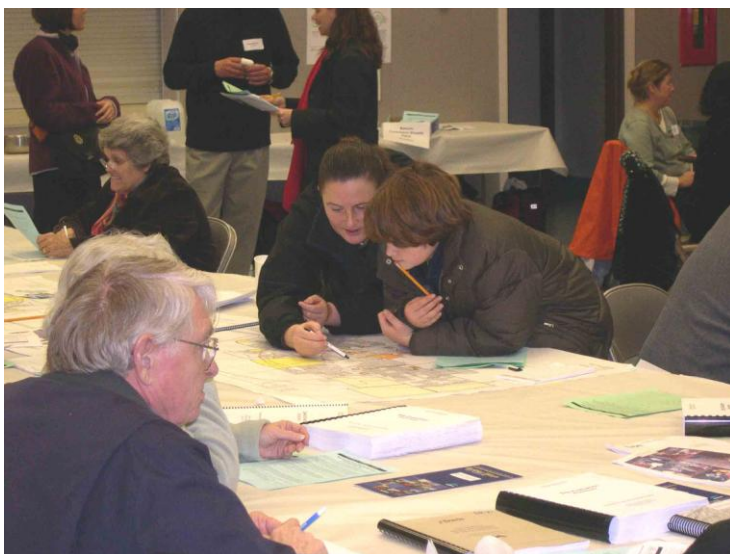
Participants Filling Out Comment Sheets at the Work Table