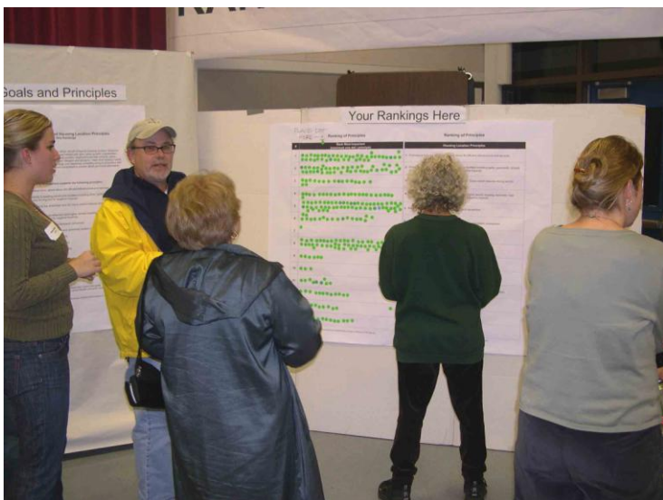
Participants Ranking Principles for Housing Sites Selection Using Dots

Below is a summary of the workshop comments from the comment sheets and the dot exercise on ranking the principles for housing site selection.