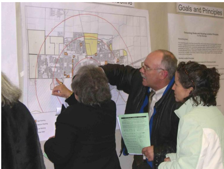
Participants Obtaining Information on Potential Housing Sites