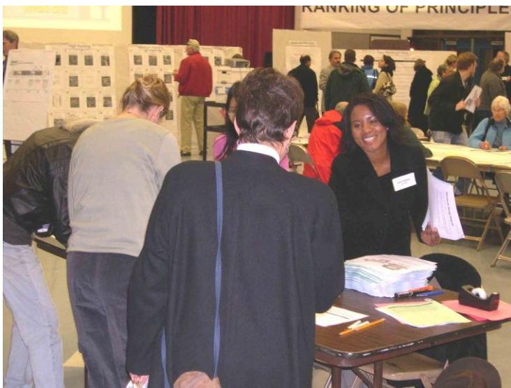
Welcome and Sign-In Table

Community Workshop #2 is part of the process the City is undertaking to evaluate potential sites for housing in Davis. This second workshop in the process was designed in an “open house” format so that participants could come and go as they please, stay as long as they want, and focus on those issues of greatest interest.