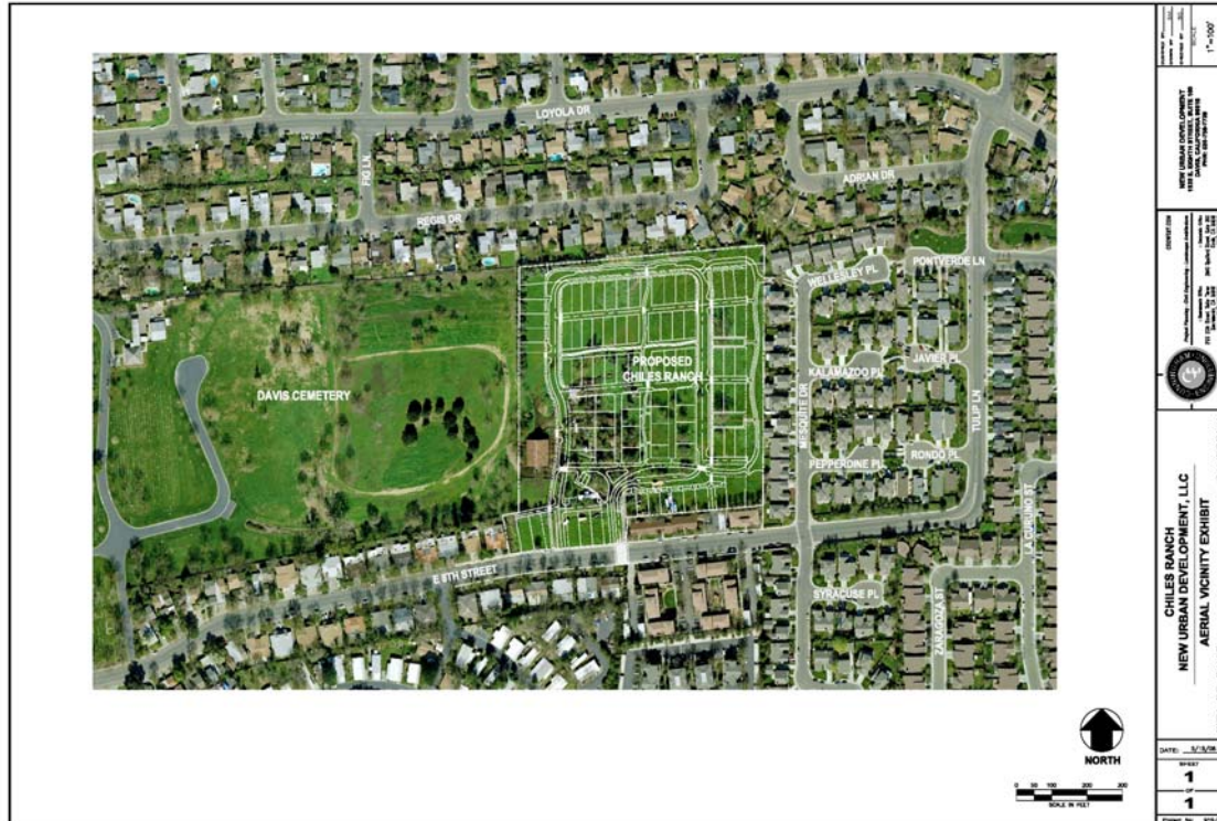
Chiles Ranch Layout