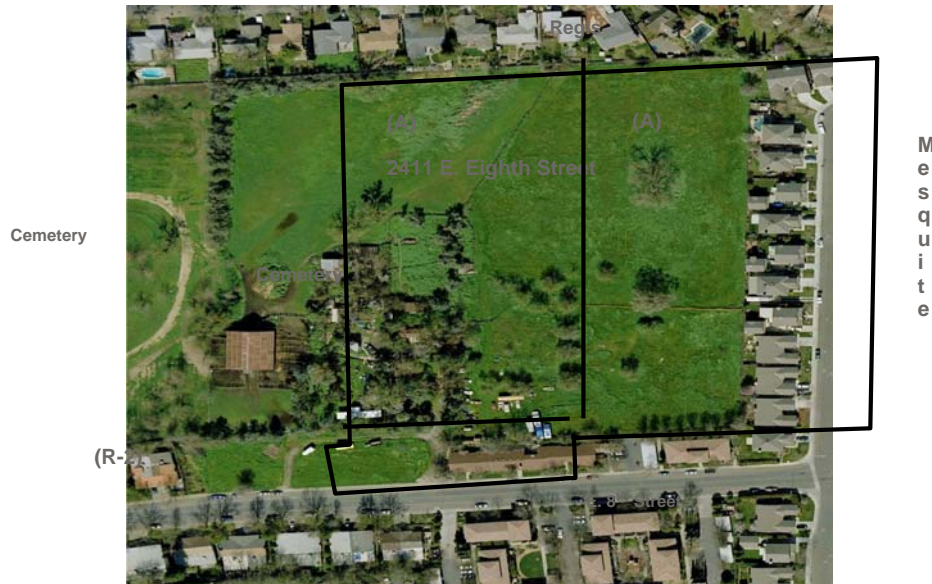
Proposed Chiles Ranch Subdivision Site (N ↑)

Overall, staff is supportive of the project and the requested entitlements. The key outstanding issue is the difference between the nearly two acres of open space (1.86 acres) that the applicant is proposing as city greenbelt and mini-park, and the significantly less acreage (.70 acres) that staff is recommending that the city accept. Details regarding the greenbelt proposal and other significant issues are identified in the further in the staff report.