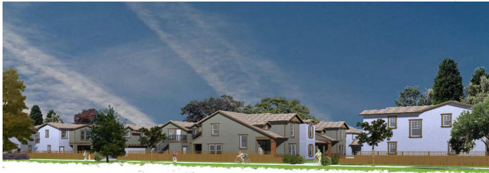
Perspective 1 Showing East Property Line at Zero without Fencing Perspective 2 Showing East Property Line at 3'3" with Fencing