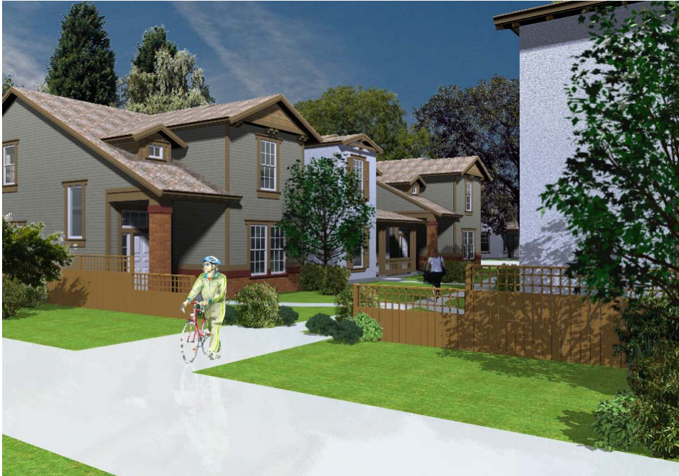
East Property Line at 3'.3" with Fencing

Staff also recommends that and the west property lines on Lots 1 and 2, and the east side property lines on Lots 3 and 4, be increased from zero to three feet, three inches. The change would be reflected on the Final Map.