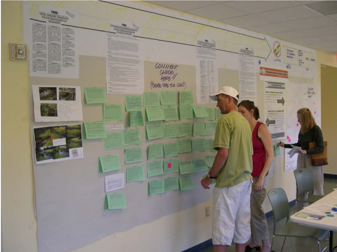
SAMPLE COMMENT WALL

o/bwolcott/gp up workshop 1 approach.doc