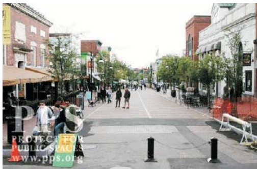
Church Street, Burlington VT