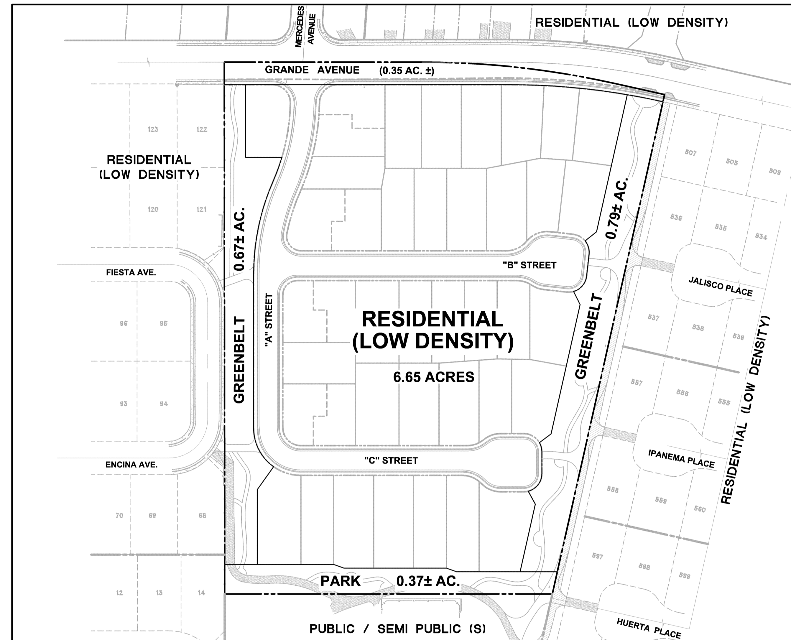
PROPOSED LAND USE