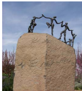
Cnawan Stone by Sandra Shannonhouse Located in the public garden at Central Park

Compensation for actual time worked during regular hours to employees who are filling special funded full time positions. All employees filling these positions will be entitled to all city benefits on the same basis as full time positions. All positions will terminate at the end of the special funding.