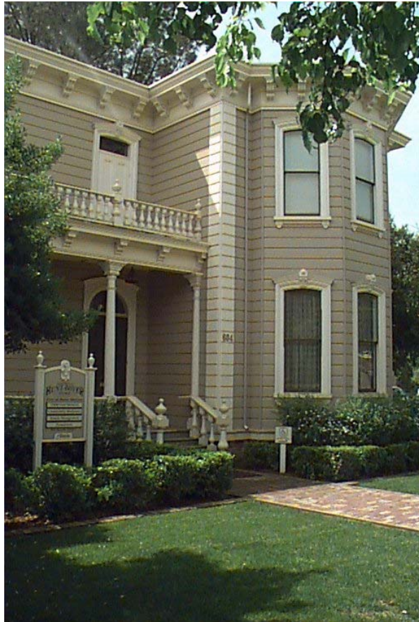
Hunt Boyer Mansion located at 604 2 nd street.

while at the same time ensuring that the portfolio is sufficiently liquid to meet day-to-day cash needs. There is diversity in the types and maturates of investments, which are made in accordance with the California Government Code. The remaining final maturity on investments is limited to five years. Currently, the average life of our portfolio is generally about three years. A Treasurer's Report is submitted to the City Council quarterly, which shows investment activity and the performance of the investment portfolio. The investment policy is reviewed and readopted annually by the City Council, as required by State law. The city's investment policy is attached as an appendix to this budget. (See Section 20, Appendices.)