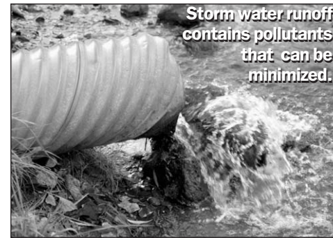
Storm water runoff contains pollutants that can be minimized.

To remind everyone about the importance of preventing stormwater pollution, the city of Davis has installed storm drain inlet markers near each drain. The City is currently in-