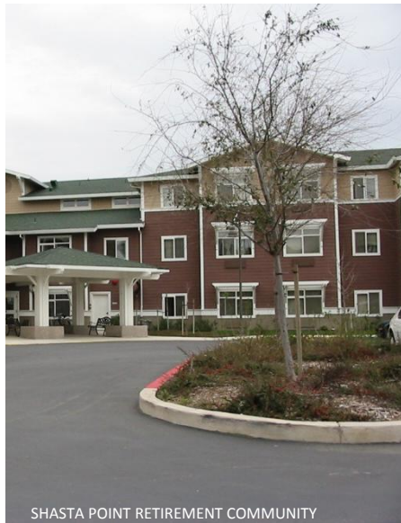
SHASTA POINT RETIREMENT COMMUNITY