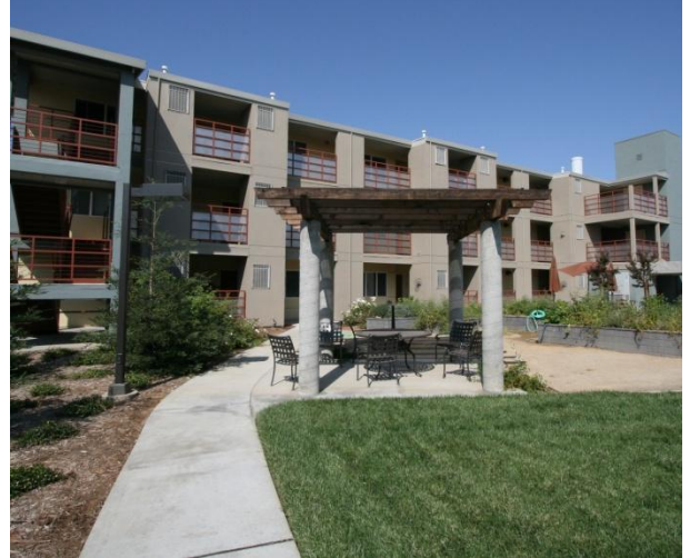
ELEANOR ROOSEVELT CIRCLE

One of the biggest accomplishments of the city's affordable housing program, is its variety of development types to meet the needs of the community. There are affordable homes and apartments, for rent and for purchase, spread throughout the city, in mixed income developments, and solely affordable developments (such as New Harmony Apartments). There are cooperative housing projects (such as the Cornucopia Cooperative and Pacifico), senior-specific housing (such as Eleanor Roosevelt Circle or Olympic Cottages), and supportive housing for individuals with special needs (Homestead Cooperative and Cesar Chavez Plaza).