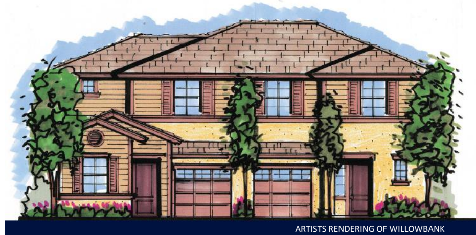
ARTISTS RENDERING OF WILLOWBANK

Often the most efficient way to build a new project, especially a project with funding constraints, is through infill, that is, building on and in existing neighborhoods within developed areas of the city. Proximity to services, transportation and retail, and local commitment to smart growth and development principles make it highly desirable for developers and planners to support infill projects.