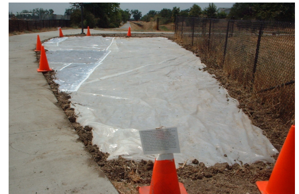
Example of solarization near bike path along Mace channel in East Davis.

Till the area to be treated. The soil needs to be broken up in order to enhance the heat conduction through the soil. Rake the surface to allow the UV resistant plastic covering to be placed in close contact with the soil. Then wet your soil, wet soil conducts heat better than dry soil does. Moisten the soil deeply. In moist soils, pest organisms are more active and are also more susceptible to the lethal effects of heat. Next, lay down the large sheets of UV resistant plastic. These can be purchased at hardware and home supply stores. Do not use colored plastic, it does not conduct as much heat as the clear one does. The plastic should be anchored down to prevent heat from escaping. This is done by digging a trench where the sides of the plastic can be pulled tight and covered with the soil in the trench. Leave the covering on for at least 4 to 6 weeks. When solarizing is complete, plant your bed with seed or healthy, uncontaminated plants.