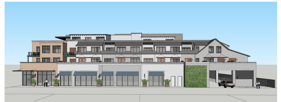
East View of Trackside, from I Street