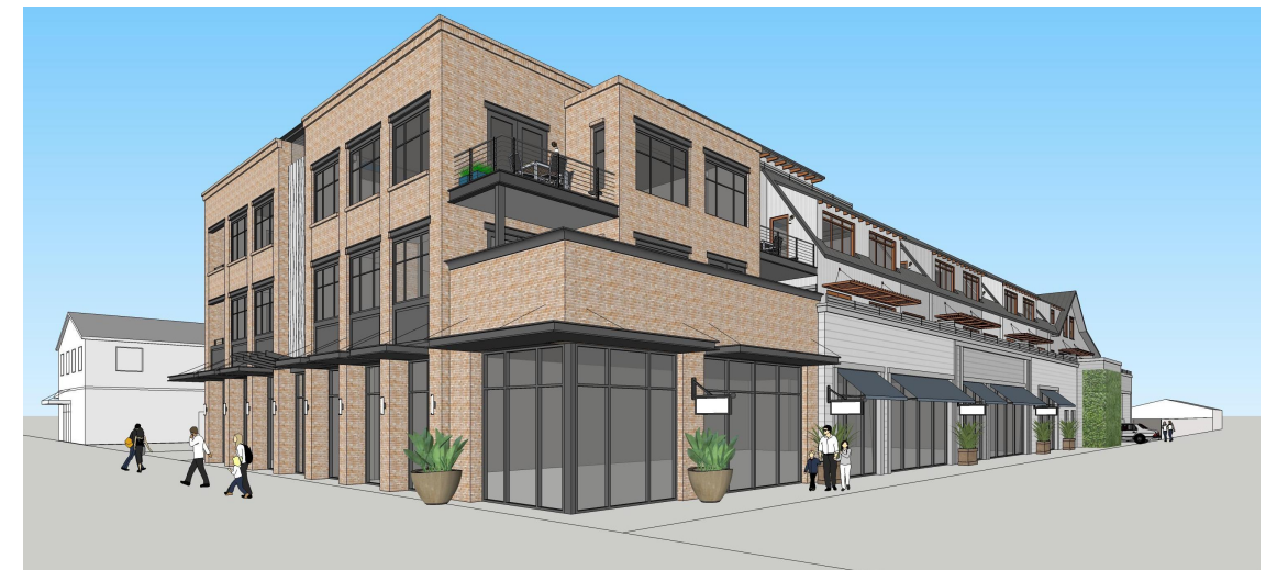
NW View of Trackside, from SE corner of 3rd & I St

NOTE: TREES HAVE BEEN OMITTED FOR CLARITY.