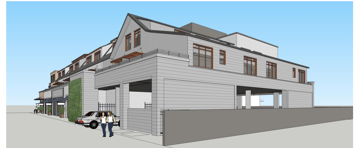
SW View of Trackside, from North Side of 4th St. looking down Alley