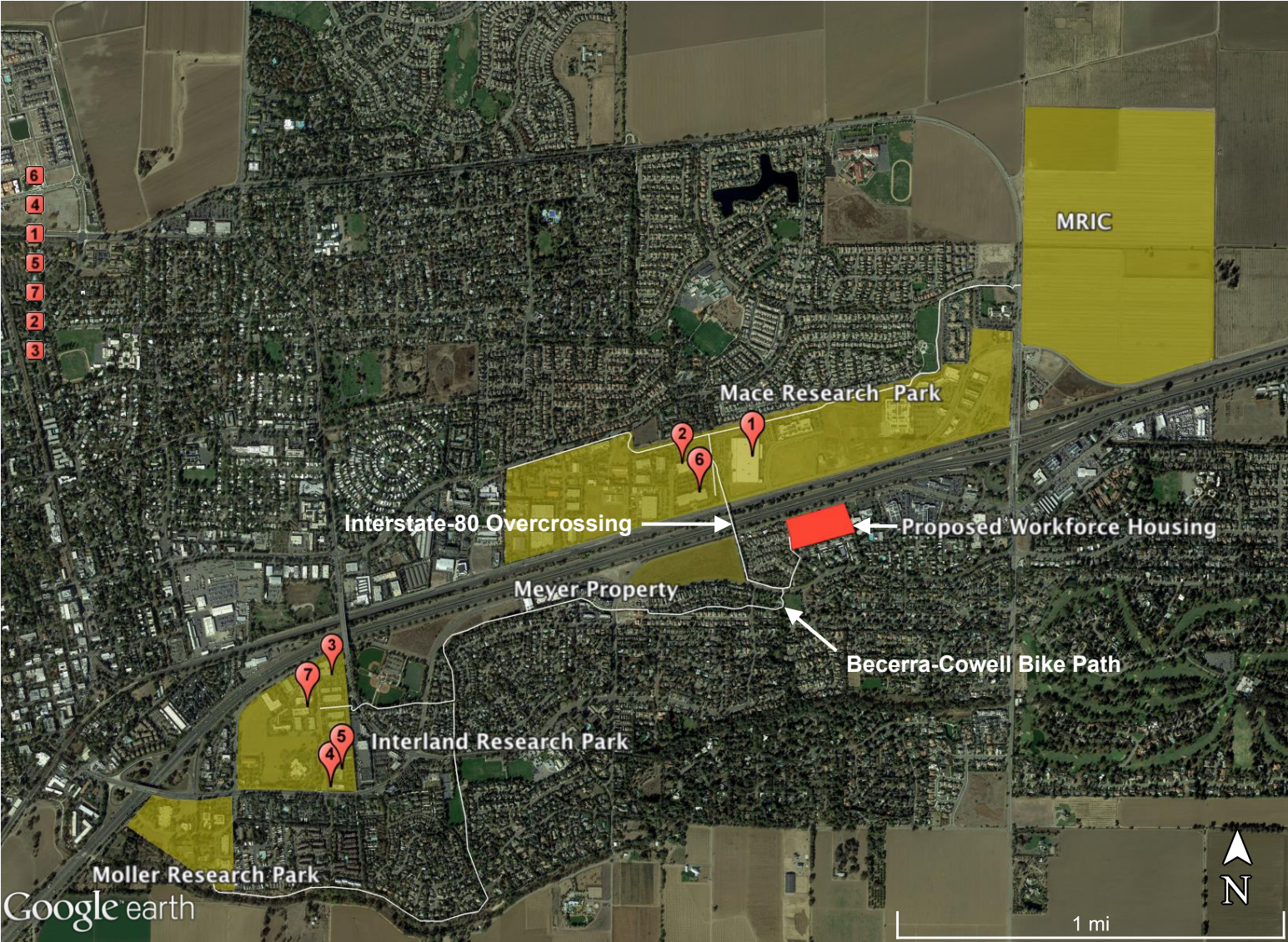
Figure 1: Employment Centers and Bicycle Connectivity