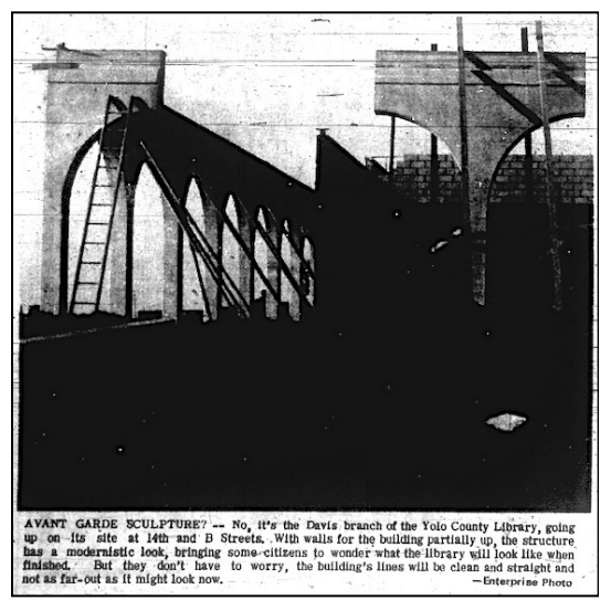
Figure 4: The "Avant Garde Sculpture" of the Davis branch library.

At the building's opening, the implied connection to the future was made explicit by burying a time capsule at the site (presumably in the promontory, though this can not be definitively established) that was to be opened in the year 2032, which would have marked the 100th anniversary of Intercoast's founding. State and local officials, along with leaders of industry, particularly from the aerospace field, deposited items in the time capsule and a color guard from McClellan Air Force Base performed at the ceremony. Later in the week, Intercoast sponsored a symposium at Sacramento's Memorial Auditorium on California life in the year 2032. Presenters included the UC Davis chancellor, the dean of the UC Berkeley school of medicine, the publisher of the Sacramento Union , and an executive of Douglas Aircraft Company. They predicted, among other things, that all future Californians would live on a guaranteed income while few would work; the common cold would be cured; there would be permanent bases on the moon and manned trips to Mars; and the daily newspaper would come packed with enough embedded calories and vitamins for readers to subsist off its pages. Later in the year 2032, which would have marked the 100th anniversary of Intercoast's foundation.