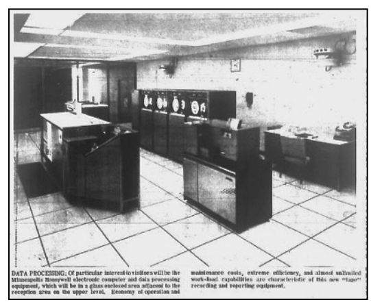
Figure 3: Honeywell computers on display at the grand opening.

at the Barovetto-designed branch library. "Avant Garde Sculpture?," the writer asked rhetorically, before reassuring readers that the new library's final lines would be "clean and straight and not as far-out as it might look now."<sup>24</sup>